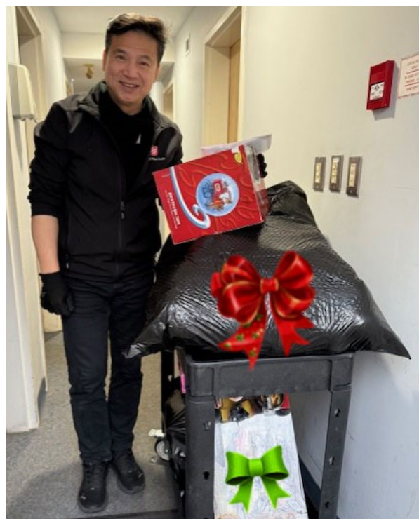
Over 45 new toys and $400.00 cash were donated to the Salvation Army Toy Drive. Following the luncheon, Leslie delivered the toys and cash from members to the Salvation Army and as always Pastor Lt. Yau gratefully accepted them saying many children will be very happy as a result of our donations.