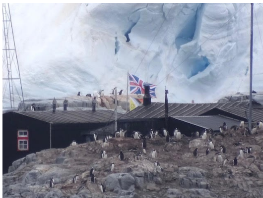
The British Antarctic Station. They don't have to go far to start counting penguins.