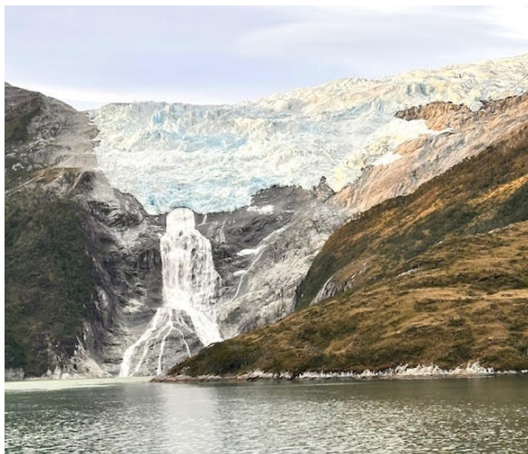
Everyone was on deck for cruising the Chilean Fjords and Glacier Alley.