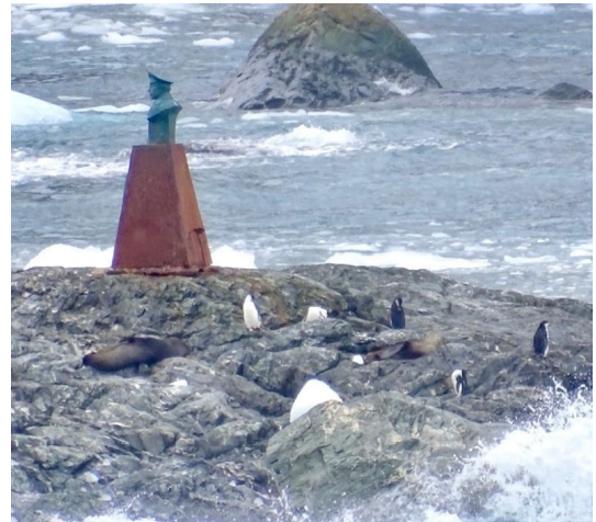
Elephant Island Memorial featuring the bust of Luis Pardo.

During the trip there was a transfer of mail to the Cruise Ship for delivery to scientific staff at the United States Palmer Research Station. The station's staff had not received any mail since just before Christmas. The mail included much needed batteries. Being "Postal Where Ever We Go", the group turned out to ensure the transfer was done properly! The station volunteers were extremely happy to receive the mail and fresh food and quickly came out in their inflatables to transfer it all ashore.