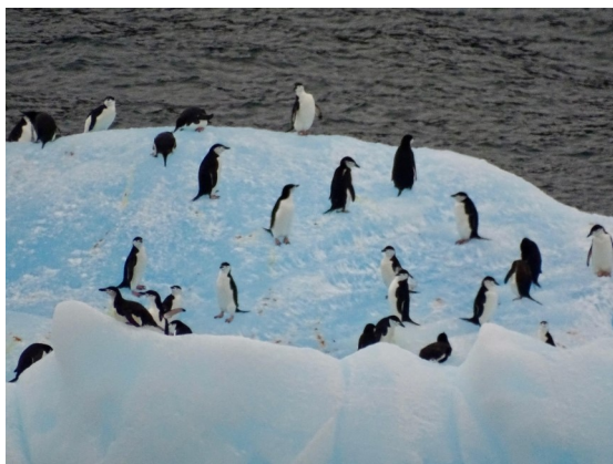
Lots of fun watching penguin floating on icebergs

The Captain got very close for us to see the British Research Station and of course the most southern Post Office in the world. The volunteer staff who work there not only process the mail that comes from it to the ships, but maintains the regular inventory of the penguins on the island (other related duties). Fred checked on any Santa mail that might have been delivered to the South Pole by mistake.