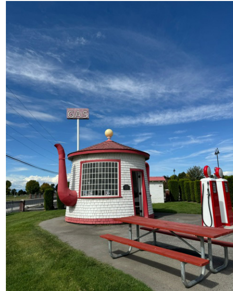
The teapot x-gas station is right next to the firefighter memorial. By coincidence we were there on Sept 11. American flag at half-mast.

We have booked the Baymont again for next September. Mark your calendar and plan to join us.