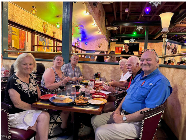
Dinner at Mexican restaurant adjacent to our hotel