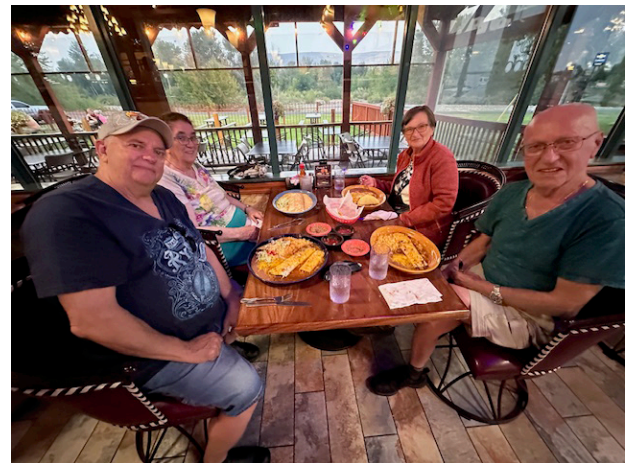
Dinner cooked on the Hotel patio