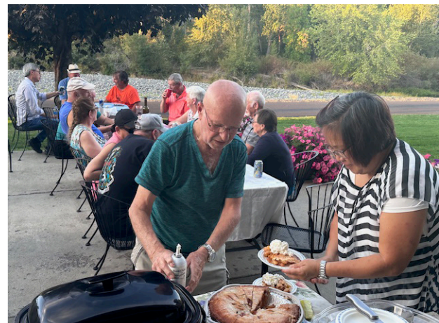
Another dinner on the patio.