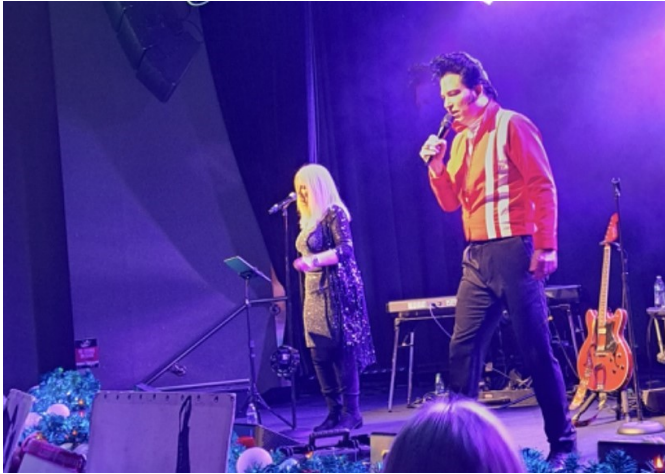
The Elvis Show at the Resort Hotel proved popular with the group