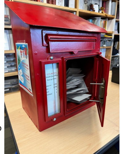
Photo above– Pole Mount Antique Mail Box arrives with Letters at the PPC.

The children were delighted to visit the display and write their letters to Santa.