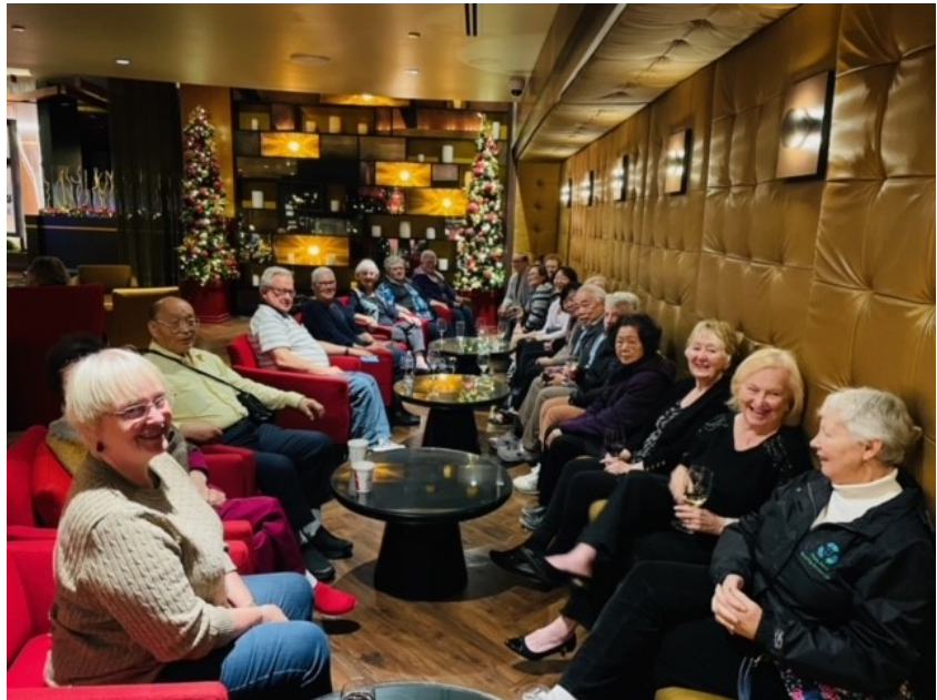
4 pm Happy Hour each day was an enjoyable time to highlight the day's experiences of shopping for bargains and showing casino winnings.

Although rain had been projected for the day, we arrived in downtown Seattle in sunshine, where everybody disembarked the bus and enjoyed several hours exploring the famous Pike Street Market, shopping at our favourite Ross Dress For Less store and having lunch in one of numerous places available in the area.