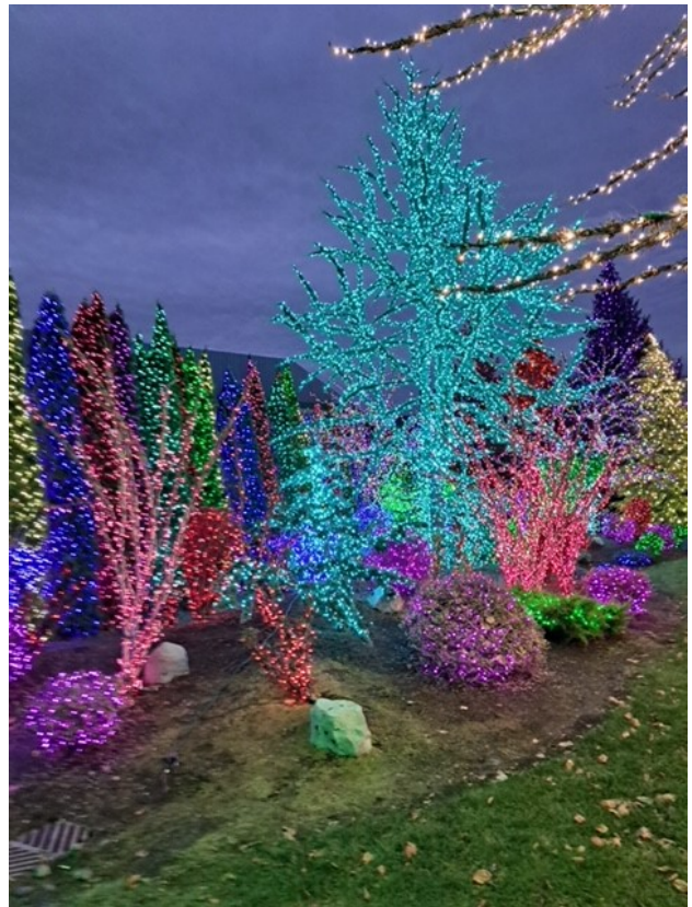
Lots of photos were taken of the fabulous light show which featured 6 million lights with the resort planning to expand next year. A great experience to look forward to.