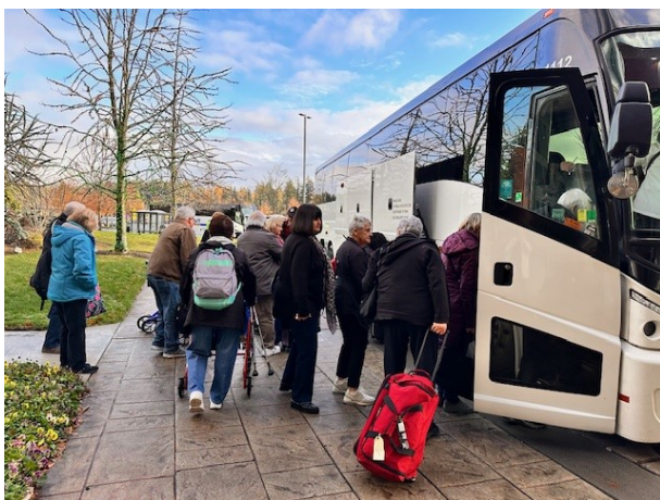
Sadly, time to return home with one more stop at Bellis Fair.

Each morning a hot complimentary breakfast was served to us in the Cedars Cafe Restaurant. We also had one complimentary dinner voucher which people used in a variety of restaurants available in the resort. The free shuttle took every one from the hotel to the factory outlets to the Walmart, Cabelas, Home Depot, to the Cultural Center, and other locations in the area. The shuttle was readily used by all of our group and most people got to do lots of shopping, sightseeing, and some may have even done well in the casino.