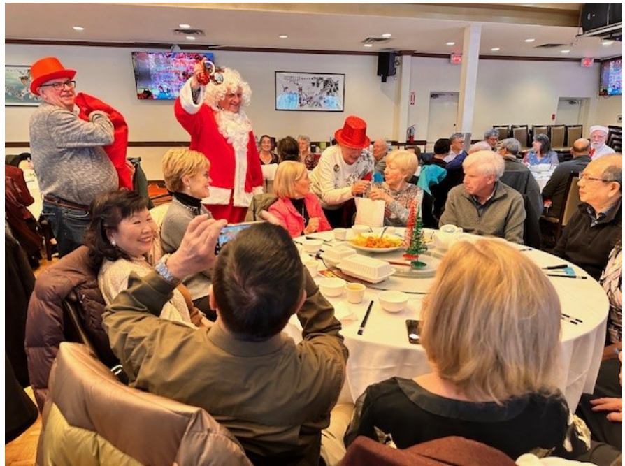
Santa visited every table bringing joy and goodies.

Donations of new toys or cash for the Salvation Army toy drive were accepted during the luncheon. We were thrilled to see such a huge display of brand new exciting toys and cash donations totaling $460. The toys and cash were delivered to the Salvation Army immediately following the luncheon. The overwhelming response of the staff to receiving the gifts and cash was humbling for us all. I'm sure we have made a great difference to some of the needy families, especially the children, who will be the recipient of our donations.