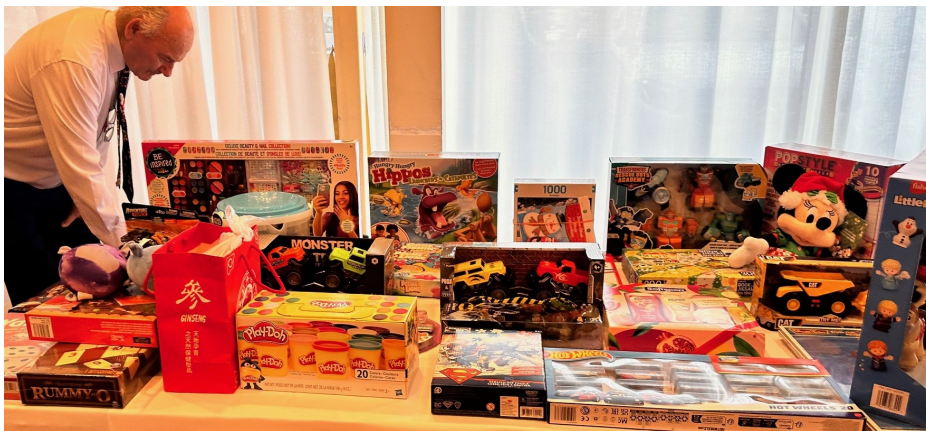
The generosity of Van Fraser members filled 3 tables overflowing with gifts for the Salvation Army Christmas Toy Drive.

Make sure you watch the upcoming events section of our newsletter and mark you calendar with our 2024 luncheons and banquet.