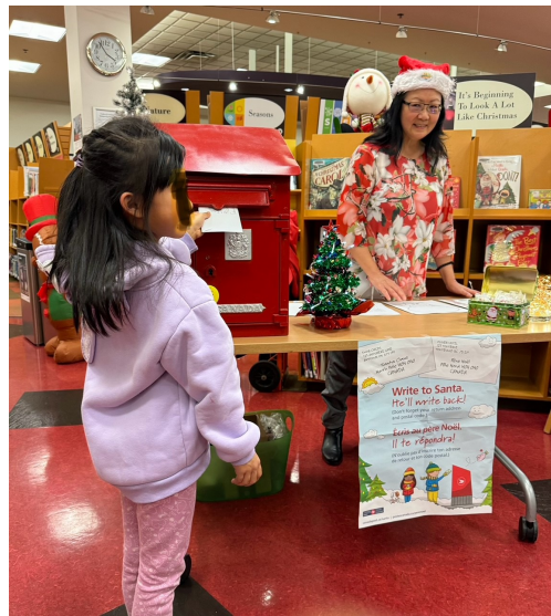
Left bottom; A young letter writer mails her Letter to Santa.

Once the letter was finished and the envelope correctly addressed, they deposited their letters in a restored antique Pole Mount Street Letter Box from the Van Fraser Archives. The SLB proved to be a huge highlight and arrived at the Richmond Processing Centre filled with letters and turned over to Santa's support Group