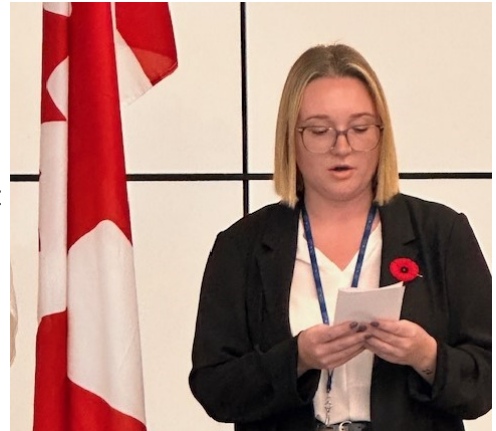
The presentation of the Poem, Flanders Fields is one of the touching moments of the ceremony