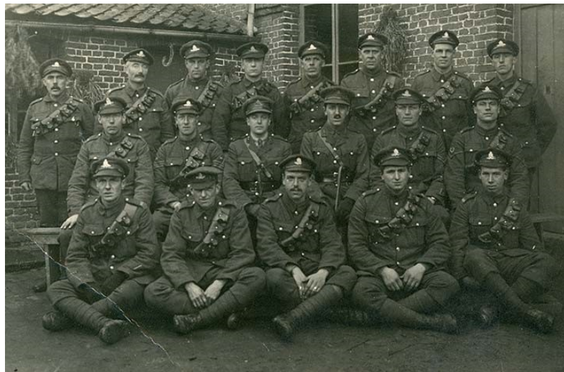
Below: Dundee Letter Carrier Volunteers

the custody of Dundee Postal Workers in the Dundee Postal Facility until the prescribed opening date.