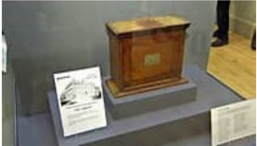
The time capsule is currently on display, along with its contents, at The McManus, the Dundee Art Gallery and Museum.

The shrine was small lead lined oak casket with a brass plaque noting its purpose. A plaque on the front of casket stated that it was to be opened by the Dundee Postmaster in the presence of the Lord Provost on August 4, 2014. The date marked the 100th Anniversary of Great Britain's entry in WWI. The box was held in