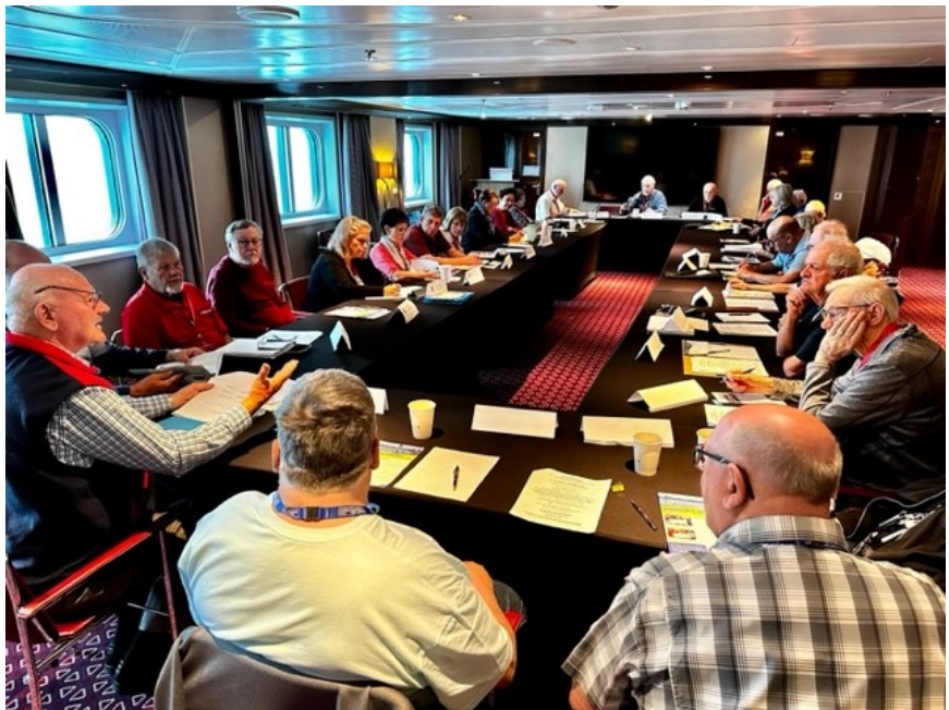
Above- Heritage Club Representatives "at sea" for their Annual Conference.