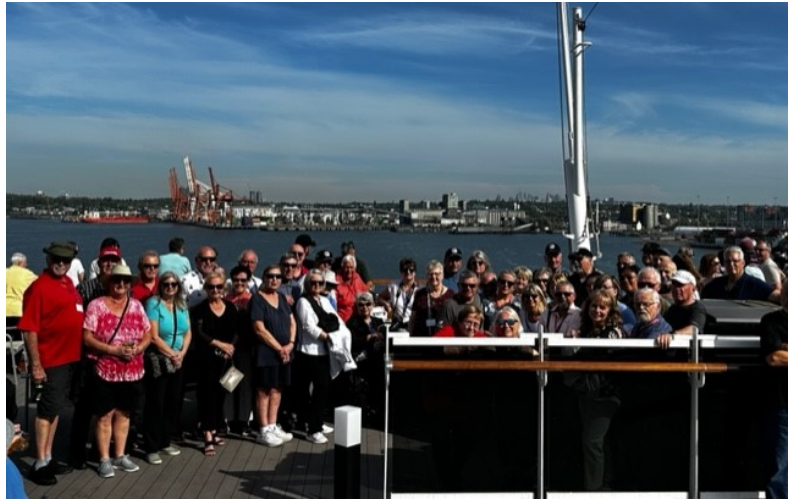
Above: Club Presidents from Newfoundland to BC and spouses gathered on deck for a Sailaway Party as the ship left Vancouver.