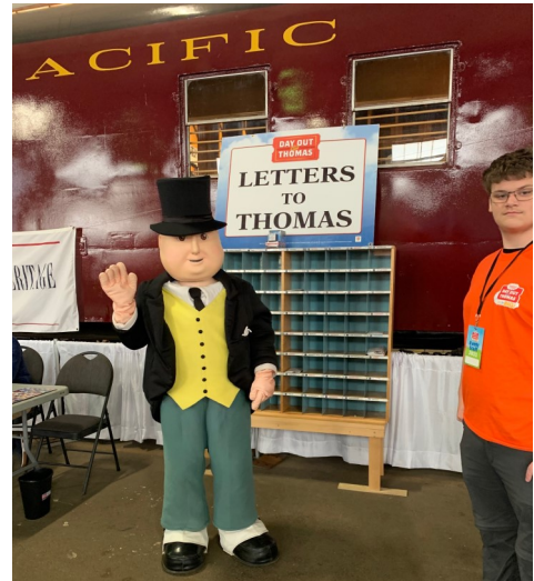
Sir Toppen Hat and a volunteer welcome the young visitors.