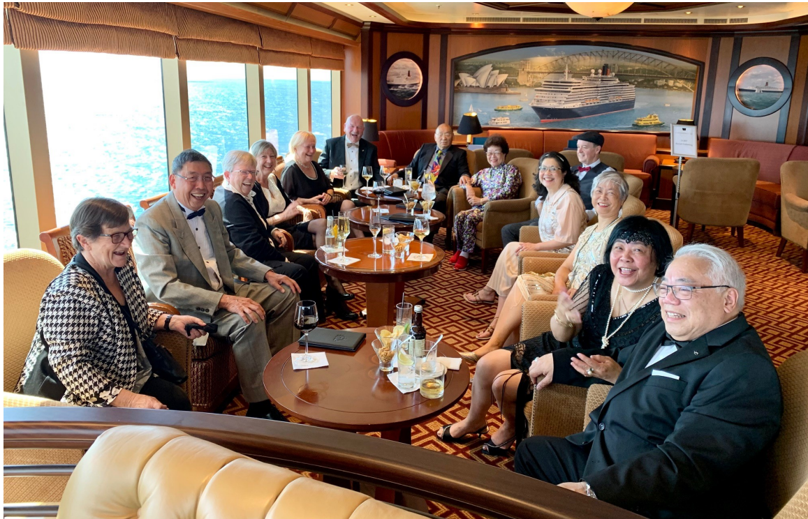
Left: Happy Hour in the Commodore Lounge.