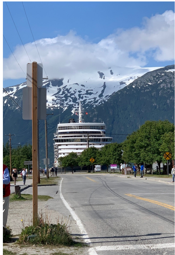
Queen Elizabeth II docked in Skagway.