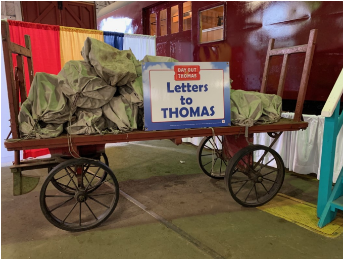
How many of our members remember loading and unloading and pulling train trucks similar to this one around?