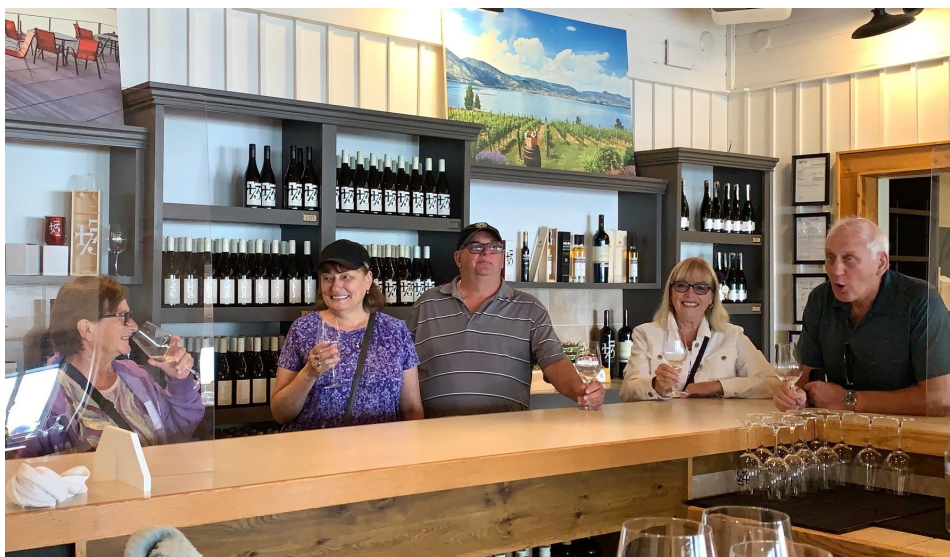
Group members sampling wine at the Bench 1755 Winery.

During the day people would go off in their own vehicles for a variety of excursions. The golfers in the group played at three different beautiful golf courses nearby while others would go sightseeing, enjoying downtown Penticton and going off to the outskirts visiting the numerous fresh fruit markets and vineyards. There were beautiful drives and walks from the hotel within 20 minutes towards Summerland and Naramata. Some picked up fresh fruit, vegetables, pastries and were able to sit by the lake or bring back to have a picnic. A group excursion was organized one afternoon to the Bench 1755 Winery, in groups of six, to sample a variety of wines and some purchases were made as well.