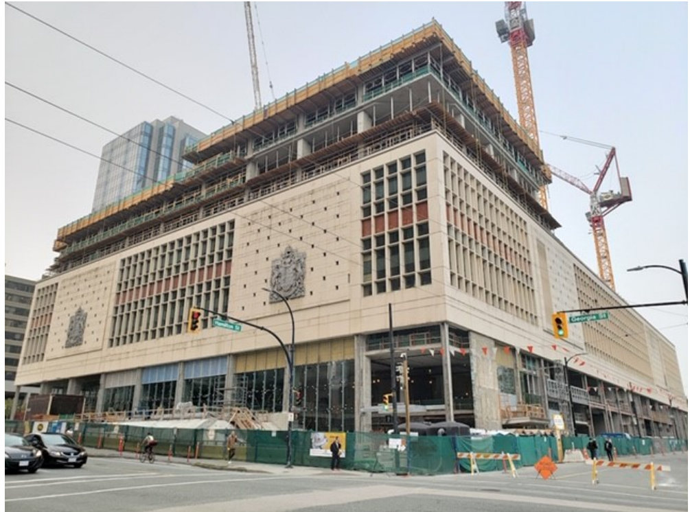
Construction of the South Tower is underway.

The majority of the 1.1 million square feet of has been already leased by Amazon who recently announced the hiring of an addition 3,000 employees in their Vancouver operation. They will have 6,000 staff situated in “The Post”.