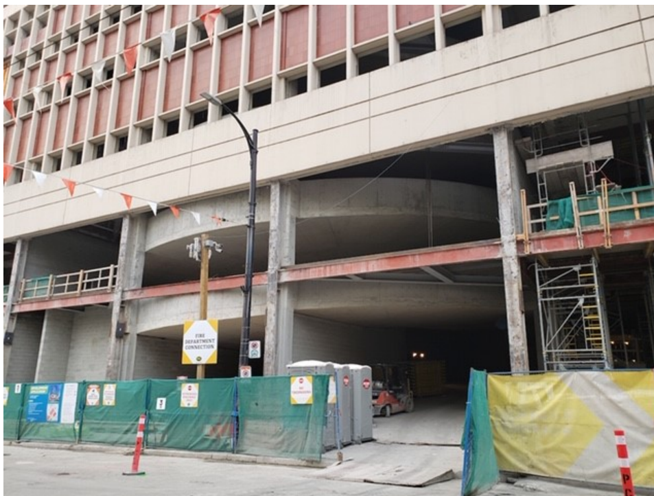
A spiral ramp for parking access from Homer Street is nearing completion, (Photo courtesy of Alan Sung)

The former retail lobby is being retained and expanded to 200,000 square feet and it's expected