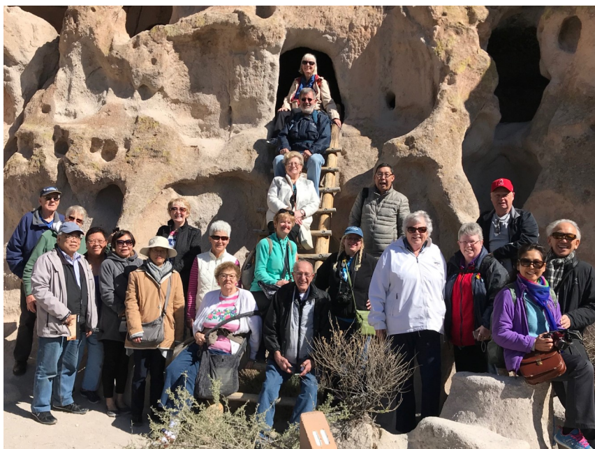
Taking a rest at Bandelier National Park