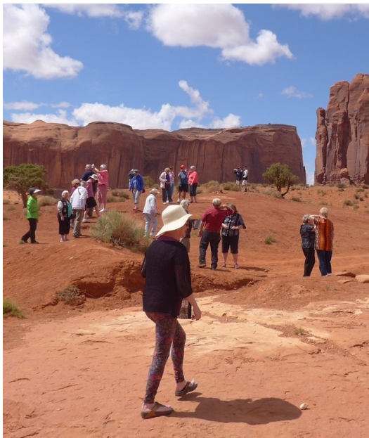
Touring Monument Valley