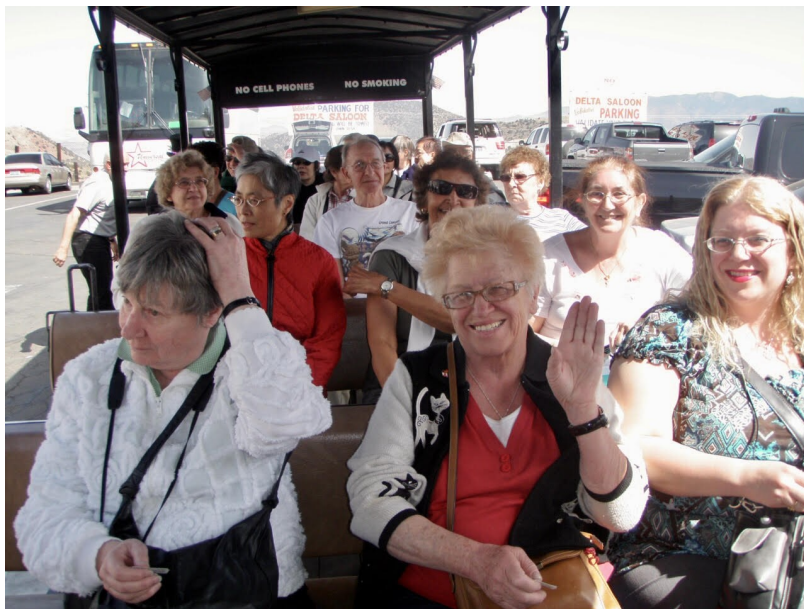
Riding around Virginia City