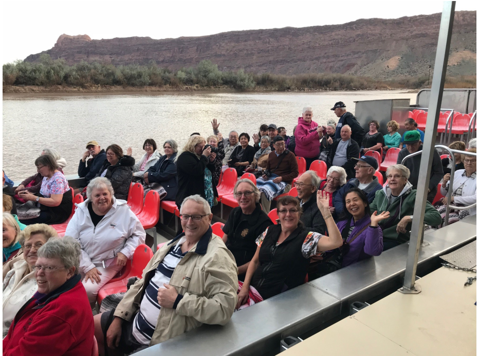
A Boat Trip on the Colorado River