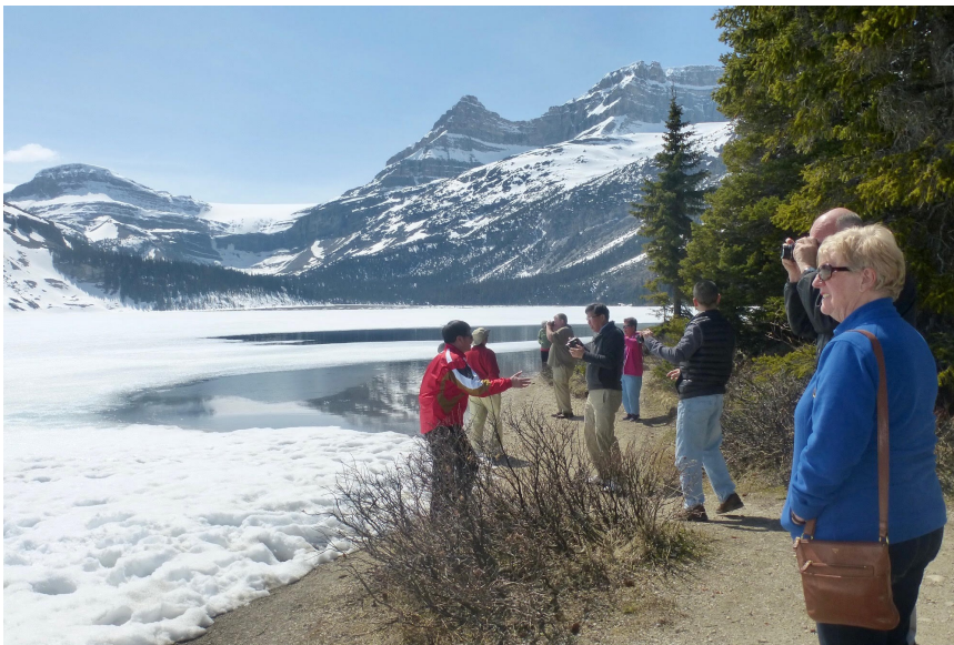
The visit to Banff