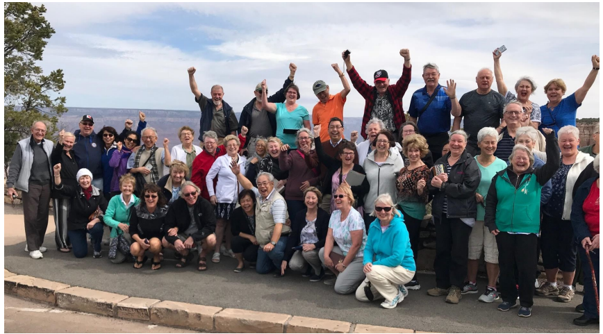
The travel group at The Grand Canyon

As we have been hunkered down for the past few months, keeping ourselves and others safe from infection, many of us have completed (or at least contemplate) a number of projects around the house. It's been a time to sort through pictures from past trips and adventures and reminisce about good times had with family and friends. The Van Fraser Travel Club has heard from many members as they send in anecdotes and photographs. Pat Metcalf shared one of her photos from a cruise in 1972 show the bar menu with most of the drinks priced below one dollar!