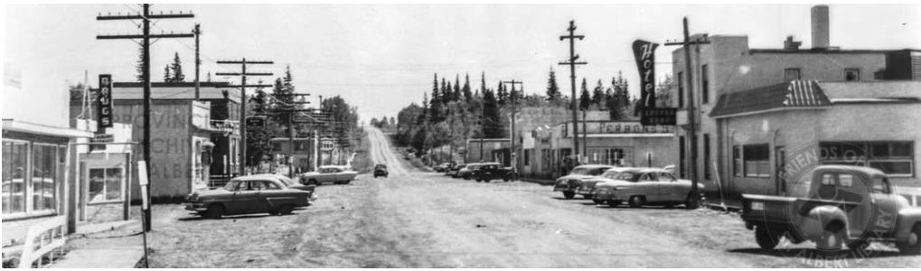
St Albert Perron Street looking south circa 1953