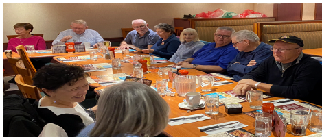
Great looking group!

On December 5, a number of Bluenose members enjoyed a late Fall luncheon at Steak and Stein in Halifax. A great day with friends!