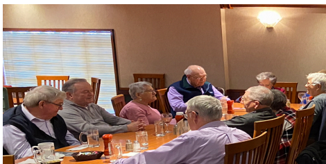
What looks good on the menu?