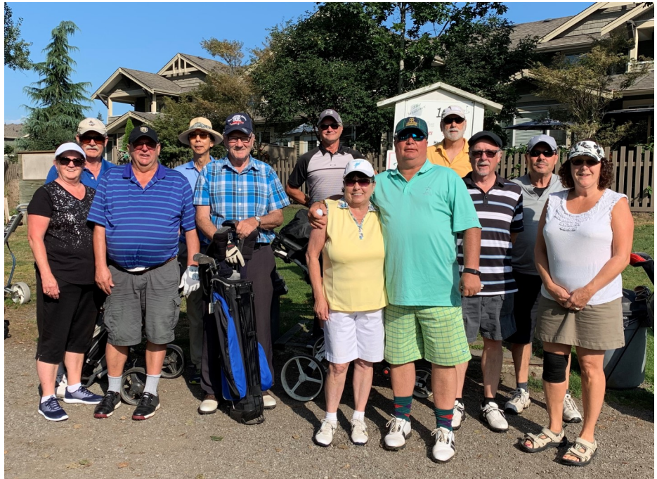
Happy group of golfers at the end of a great day.

Van Fraser members enjoy a wide variety of activities and if you have an idea please let the Executive know at 604 482-4311.