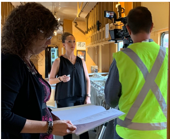
Danielle Ploude provided the French Commentary for the video.

Railway Mail Car 3704 was built at the Canadian Car Foundry in Montreal in 1948 and was originally built as a combination Railway Mail Car and Baggage Car but was used only as a Railway Mail Car. It was used on a number of Railway Mail Services in Western Canada and in 1963 was put on the Vancouver/Calgary Service- the Van/Cal Railway Mail Service. The car made its last run in 1968 and was put in storage until 1988 when it was purchased, along with 50 other railway cars, by the Westcoast Railway Heritage Park.