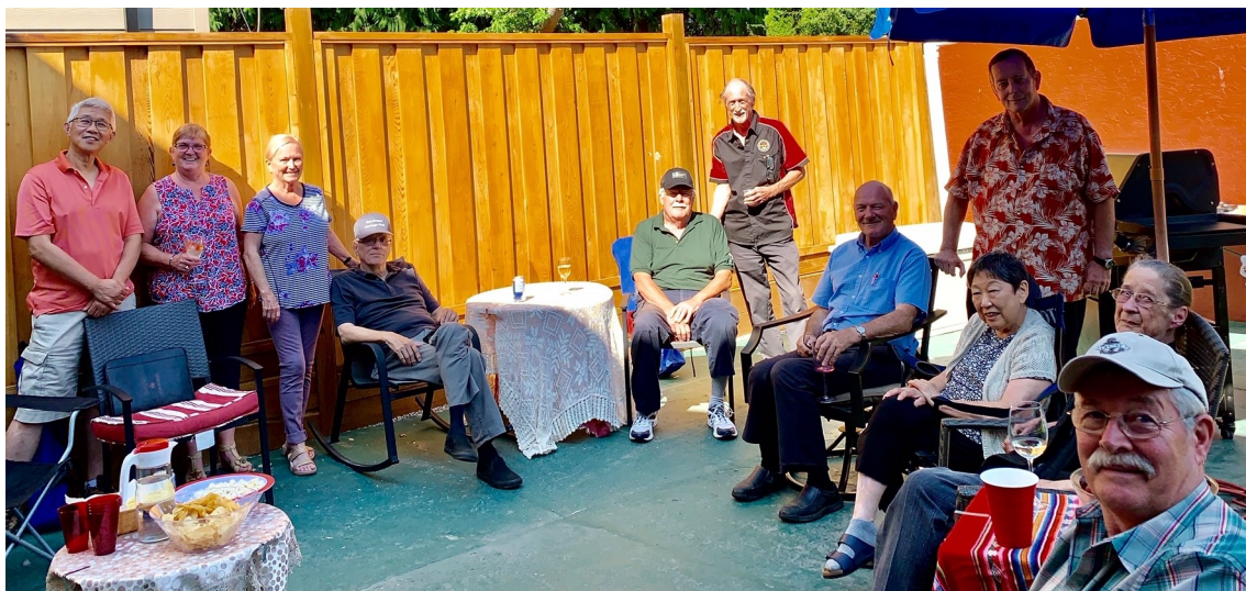
Van Fraser Executive relaxing following the Planning Session,