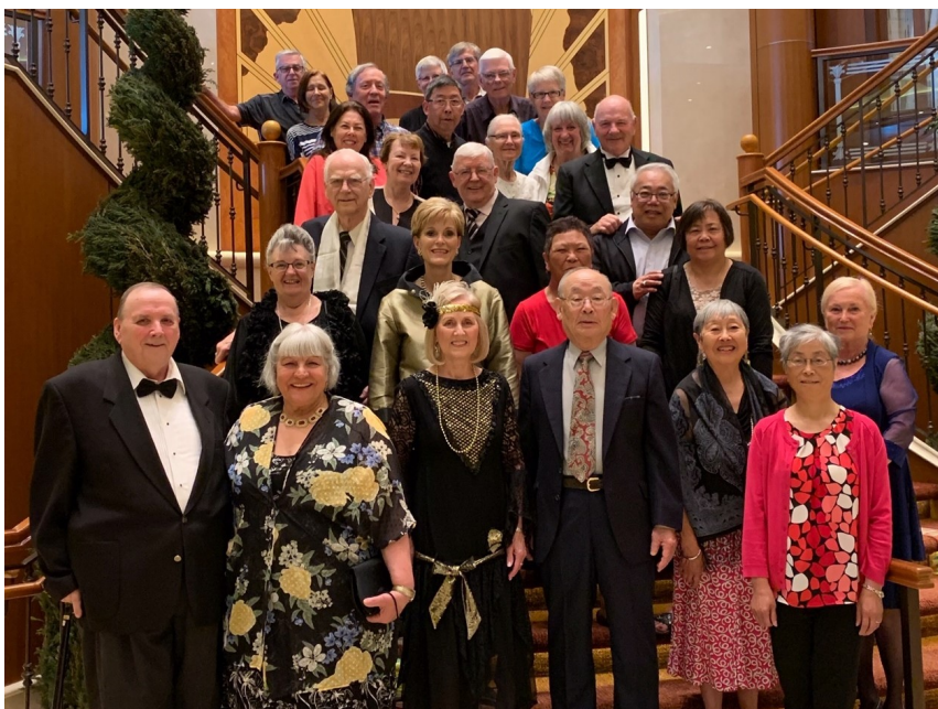
Van Fraser members enjoyed formal dining aboard the Queen Elizabeth II

For all the Van Fraser Members this was their first cruise on a Cunard liner and it lived up to its reputation and tradition of exquisite service and elegant décor. "This is like cruising in the old days, much more traditional" was one of the comments regarding service, along with, "I feel like I'm a Princess" .