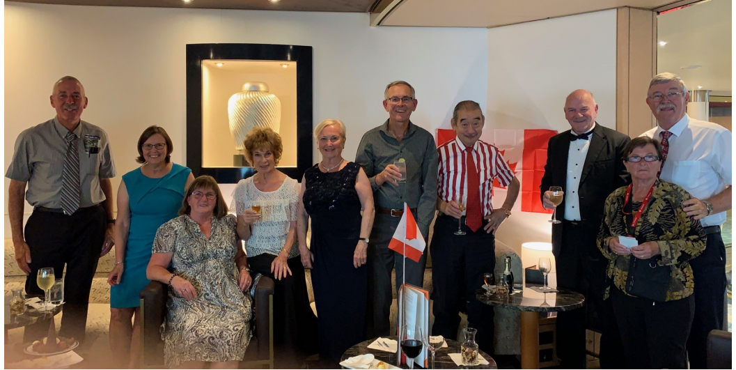
Celebrating Canada Day aboard the Westerdam.

As the Westerdam cruised through Alaskan waters there was the always spectacular scenery to enjoy stops and visit ports along the way. Stops at Ketchikan and Juneau provided the opportunity to consume large quantities of Alaska King Crab. The stop at Icy Strait Point Dungeness Crab was the meal of choice.