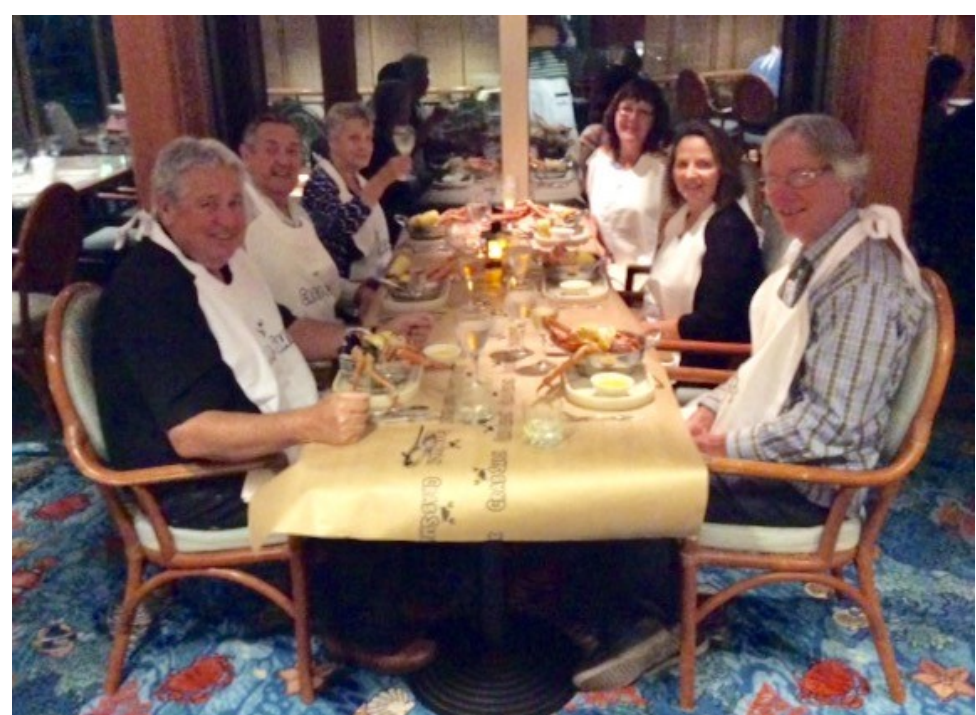
Dinner at the Crab Shack is always an enjoyable, if somewhat messy, event.

Once again, Heritage Club members enjoyed ten days in October aboard the Star Princess cruising along the West Coast from Vancouver to California and back again.