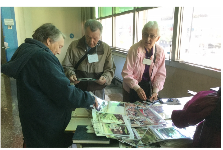
The photo table was well visited with a great many photos taken as a souvenir of past events.