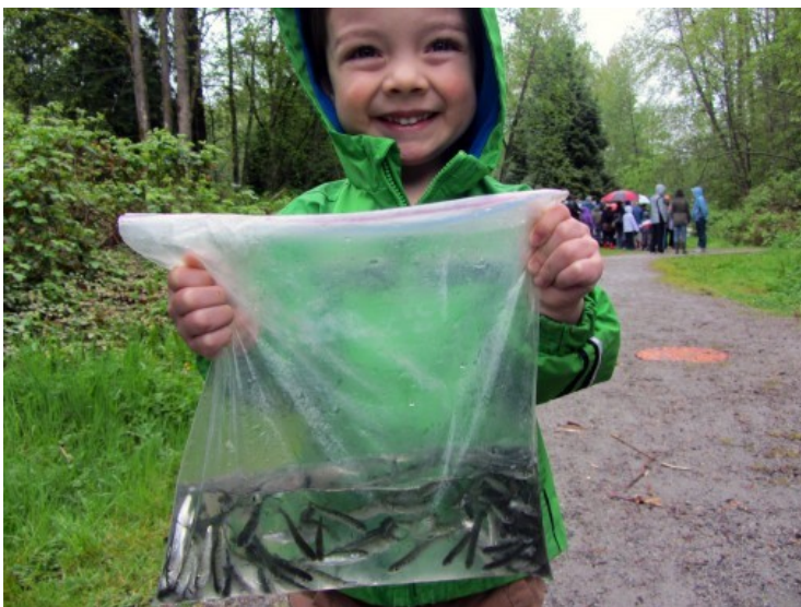
Old and very young turned out to help.