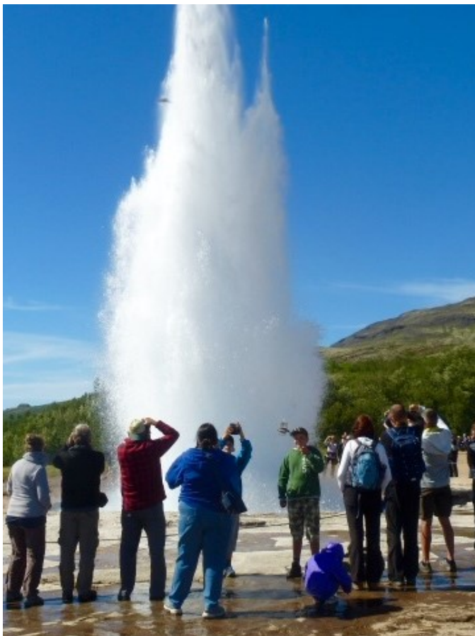
The group visiting one of the many geyser sites in Iceland.

If any members are interested in enjoying voyages such as this check out Page 10 for all the great tours and trips, both long and short, that you might enjoy!