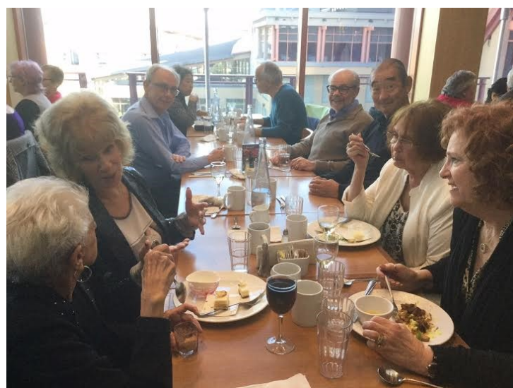
Happy Casino Winners celebrating their success?

Some members tried their luck in the casino before and after the luncheon.