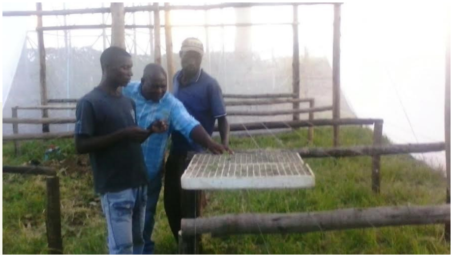
Growing seedlings to transplant to the greenhouse.

This coming year the Heritage Club Funds will be directed towards projects at these two orphan centers again. The plan is to install a drip irrigation system at Musana. This will make the garden area far more productive as well as conserve water. Water has become a major concern in Zimbabwe again. After several years of improved rainfall they are back into a drought situation.