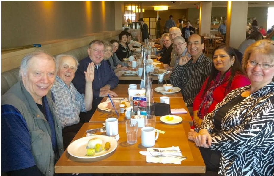
Van-Fraser Members enjoying the day at the River Rock Casino.

The buffet was abundant with a huge array of food and lots of choices for everyone. Many were commenting that they certainly would not need dinner that evening.