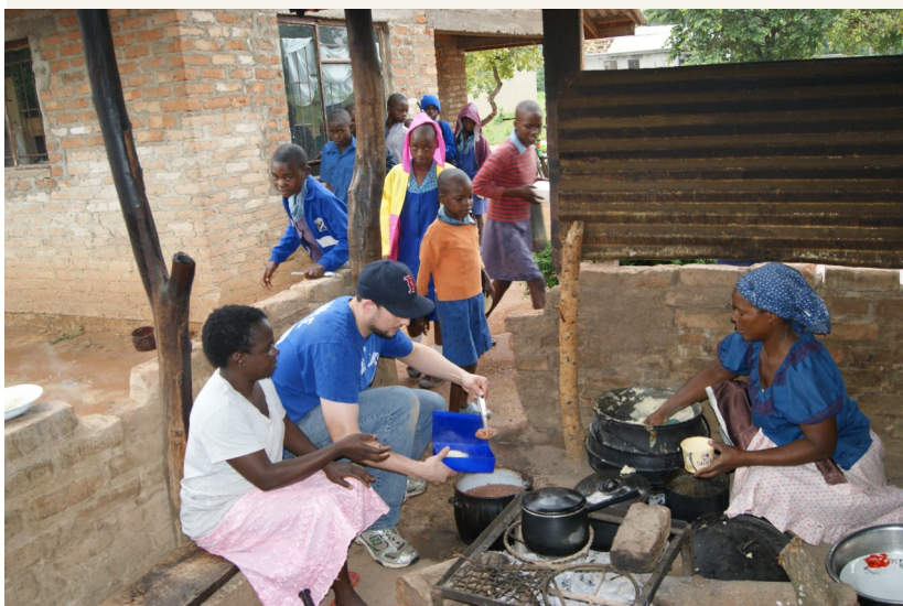
Orphans lining up for lunch at Musana.

At Mbare the funds will be used to drill a new well. The current well at the site has run dry. The new well will be drilled at least 15 meters (approx. 50 feet) deeper and in a different location on the property. A geological water survey has already been conducted and the best site to drill has been identified. The water will be utilized by the orphan center, the surrounding community and to support the greenhouse operation.