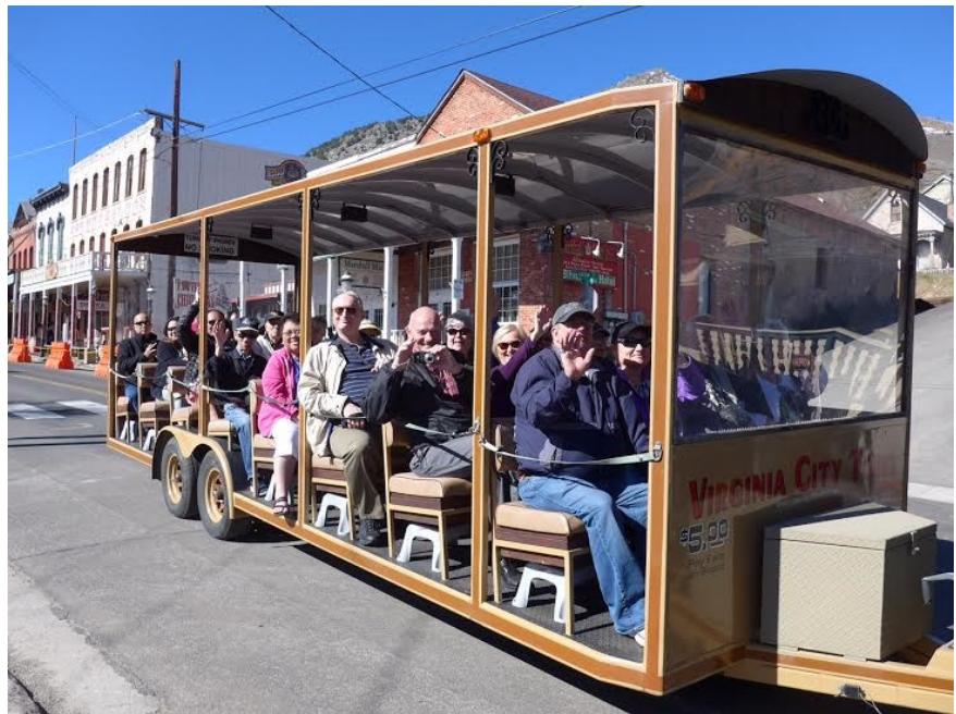
A trolley ride prior to a Walking Tour of Virginia City.

Members were mesmerized by the beauty of national parks as in a matter of days they visited Crater Lake and Death Valley. At Crater Lake passed by snow banks higher than the bus and viewed crystal clear deep blue waters and then a few days later travelled through the dry barren landscape of Death Valley where temperatures soared to 101 degrees Fahrenheit.