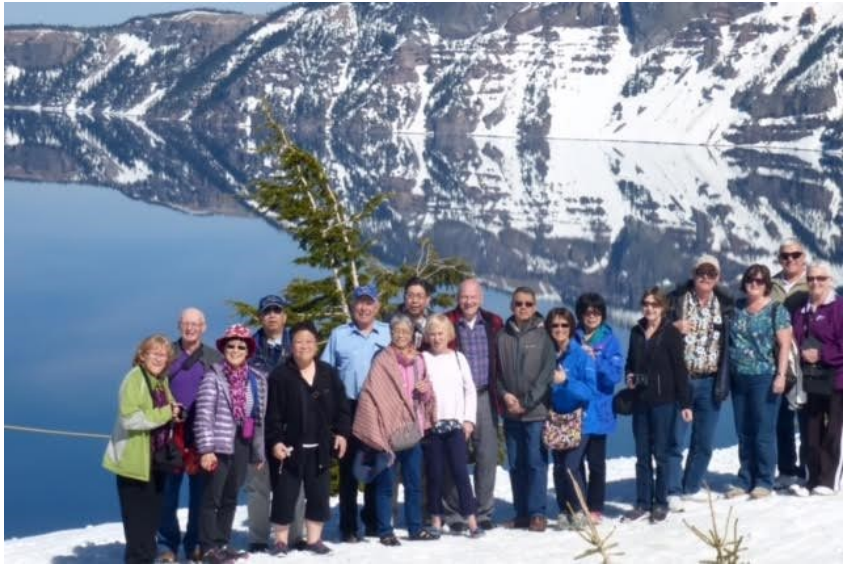
The group visiting Crater Lake.

While in Reno for two nights, there were more choices from relaxing around the hotel or a tour to historic Virginia City, complete with amazing scenery through the mountains. Prior to a walking tour of the small, rustic cowboy town, everyone hopped on the trolley for a guided informative tour of the town. After walking about, taking in all the history, some were found in places like the Bucket of Blood Saloon, the Delta Saloon, Red Dog Saloon or Mark Twain lodge having a drink or some lunch. What a fun place