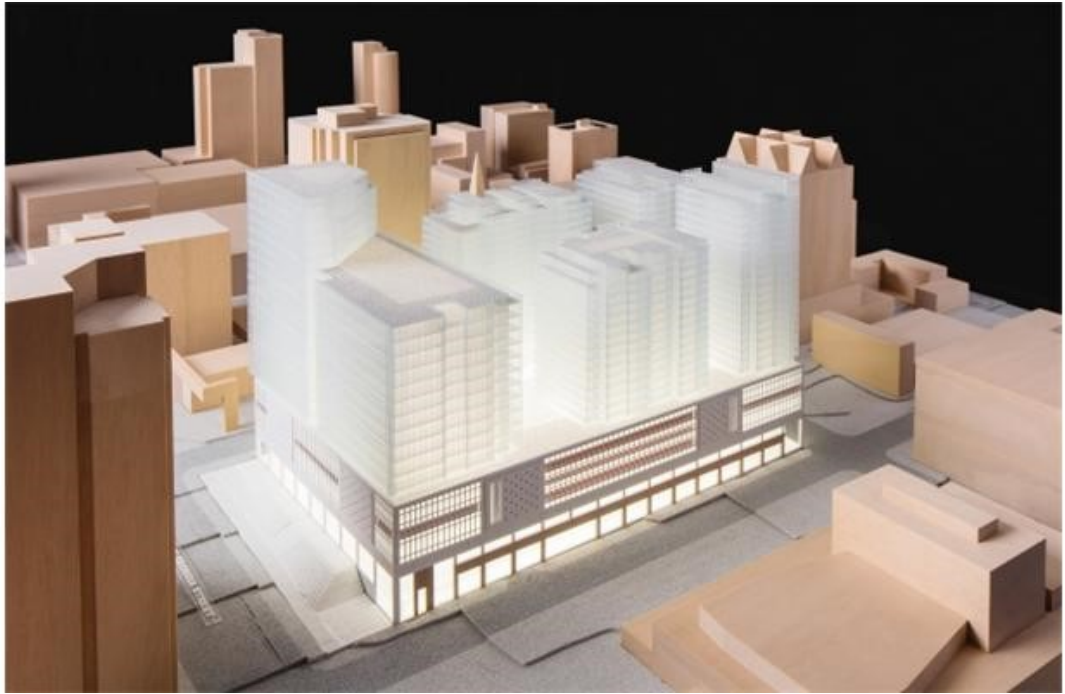
Model of the proposed changes for the former Vancouver Mail Processing Plant, 349 West Georgia, Vancouver.

The building is now owned by BC Investment Management, the 4th largest pension fund management company in Canada. The firm handling the development is Bentall Kennedy. The design is being undertaken by the architectural firm of Musson Cattrell Mackey Partnership.