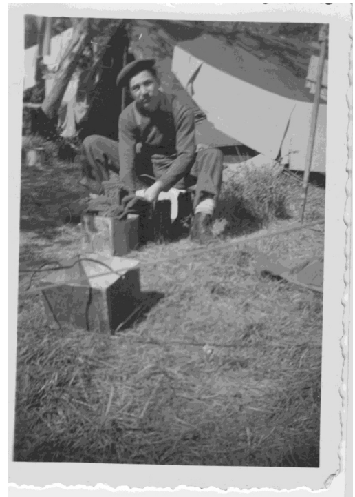
This photo was simply labelled;