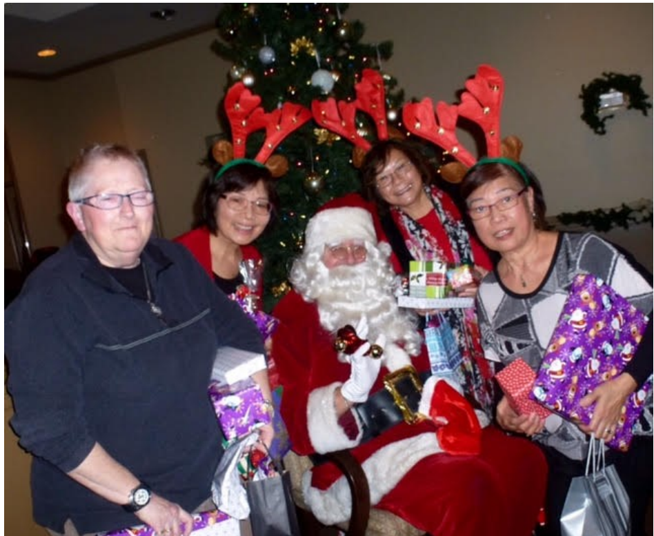
Santa and his elves handing out Christmas gifts to attendees.