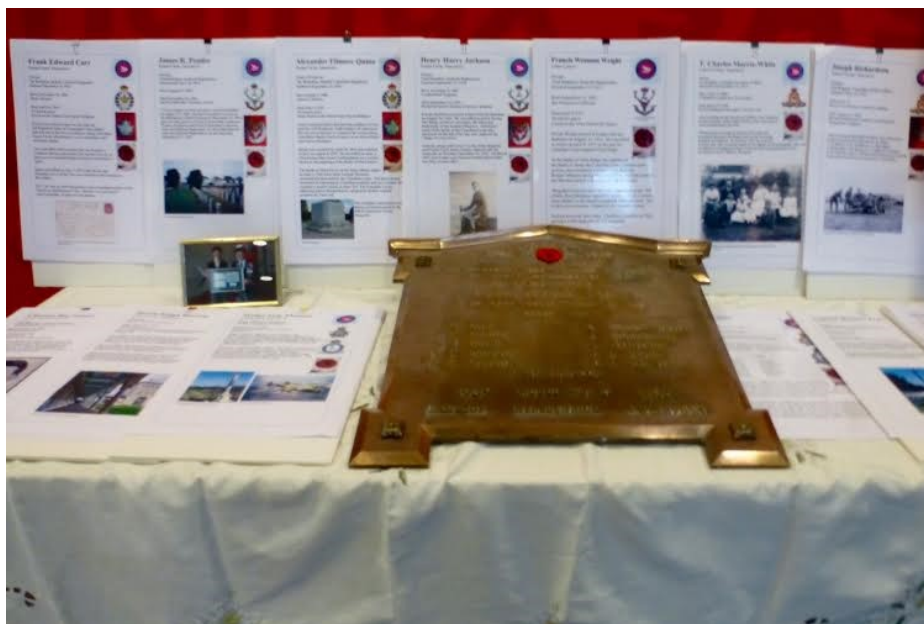
Remembrance Day Lobby Display

This research has provided considerable information on each employee from British Columbia and a Lobby Display was created for the Pacific Processing Facility employees.