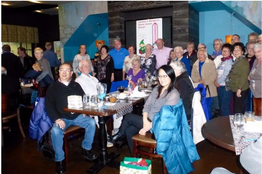
Santa's Elves pose for one last photo after the luncheon.