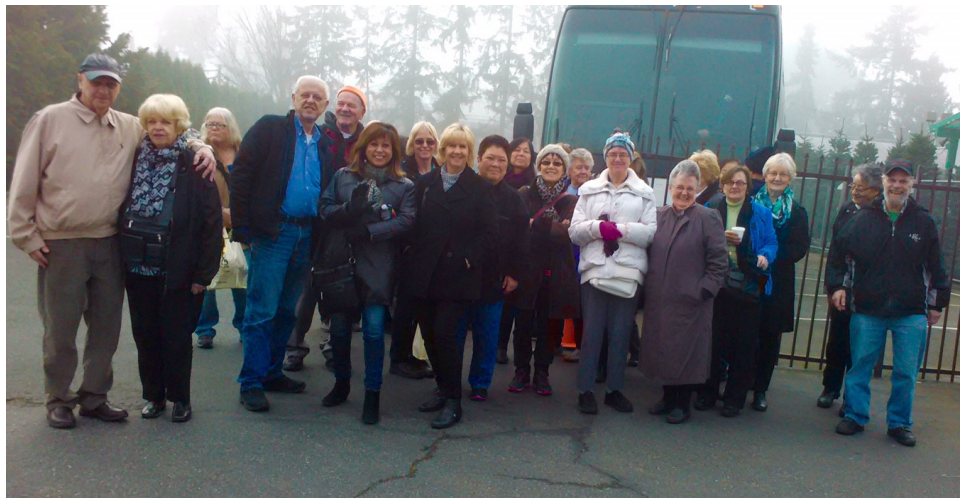
The group getting ready to board the bus en route to Christmas shopping.

decorations. The Alderwood Mall was just around the corner from Whyte's and provided some serious Outlet Mall shopping. As usual everyone was thrilled with their rooms at the resort and enjoyed the casino, buffets, shopping at the Premium Outlets, pool times and Happy Hour. The bus was somewhat heavier on the way home.