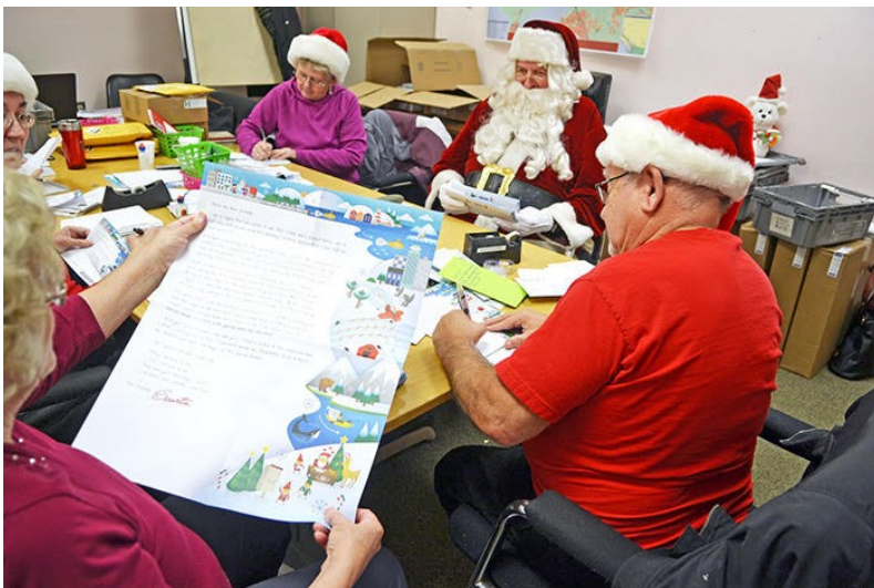
Santa's Workshop in Langley

workshop to pick up bundles of mail to work on and have a visit with fellow elves. Others have Santa's Mail delivered to their home.