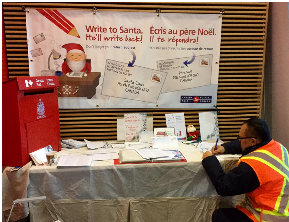
Lobby Display in the Pacific Processing Centre.

It was pleasing to have so many experienced elves return and to give a very happy welcome to a number of new elves this year. Some of the new elves brought language skills necessary to respond to letters written in languages other than English or French.