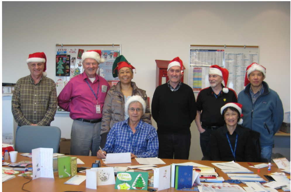
A group of Elves at the Pacific Processing Facility

While the main Santa workshop is in Richmond at the Pacific Processing Centre, there are satellite workshops in Surrey, North Vancouver, Langley, Abbotsford, and Chilliwack. Other elves prefer to work from home. Some coming into the