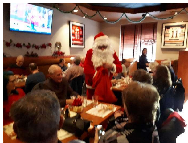
Santa made a visit to the Christmas Luncheon held on December 13.

Come and enjoy a great lunch at a great price and share some good times with old and new friends.